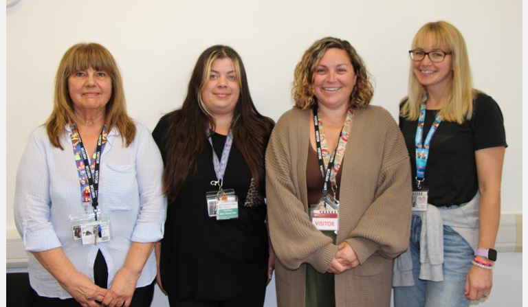
The Fireflies Team

Fireflies Childcare aims to provide your children a home-style environment where they feel comfortable, confident and cared for. We understand that parents need reliable and trustworthy childcare and that children need a fun and enjoyable experience. We deliver this at our four venues and holiday club in Eastbourne, East Sussex.