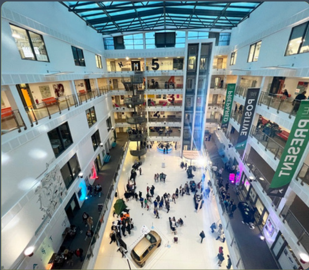
STATION PLAZA OPEN EVENT 2023 ↓