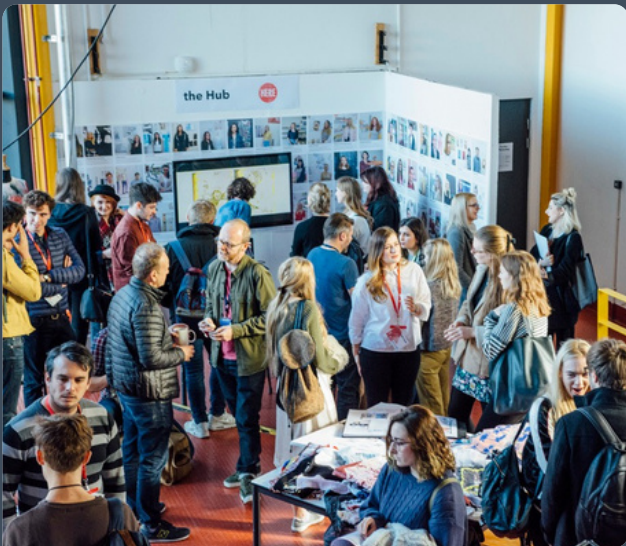
EASTBOURNE OPEN EVENT 2023 ↓